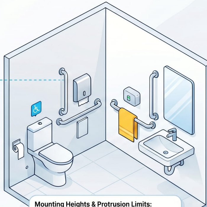
Mounting Heights & Protrusion Limits:

Detectable Leading Edges: Items mounted 68cm (26") or lower from the floor may protrude any amount.